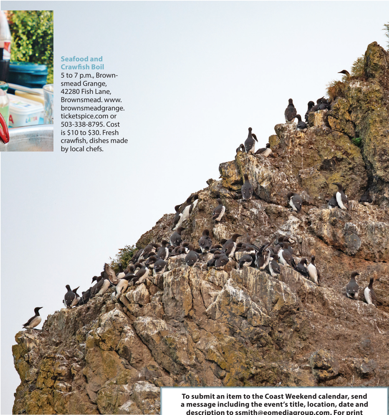
Puffins and other birds rest on Haystack Rock.

Tufted Puffin Walks 7 to 8:30 a.m., Downtown Cannon Beach. www.cannonbeach.org or 503-621-6170. Birdwatching event. Beach Volleyball Tournament 8 a.m. to 6 p.m., Seaside Beach, Seaside. www.seasidebeachvolleyball.com or 503-738-6391. Volleyball tournament, featuring adult doubles and junior quads. Astoria Regatta 9 a.m. to 5 p.m., Downtown Astoria. www.astoriaregatta.com . Historic festival celebrating maritime history, with a fun run, sailboat open house, land and sea parades. Ilwaco Saturday Market 10 a.m. to 4 p.m., Port of Ilwaco, 165 Howerston Ave, Ilwaco. www.ilwacosaturdaymarket.com or 360-670-0120. Market featuring local produce and goods. *This event repeats on Saturdays through September. Pier 39 Saturday Market 10 a.m. to 3 p.m., Pier 39, www.pier39-astoria.com . Seasonal market on the pier. *This event repeats on Saturdays through October. Sit & Stitch 3 p.m., Homespun Quilts & Yarn, 108 10th St., Astoria. www.homespunquilts.com or 503-325-3300. Knitting circle. *This event repeats on Saturdays. "Shanghaied in Astoria" 7 p.m., Astor Street Opry Company, 129 W. Bond St., Astoria. www.asocplay.com or 503-325-6104. Theater production.