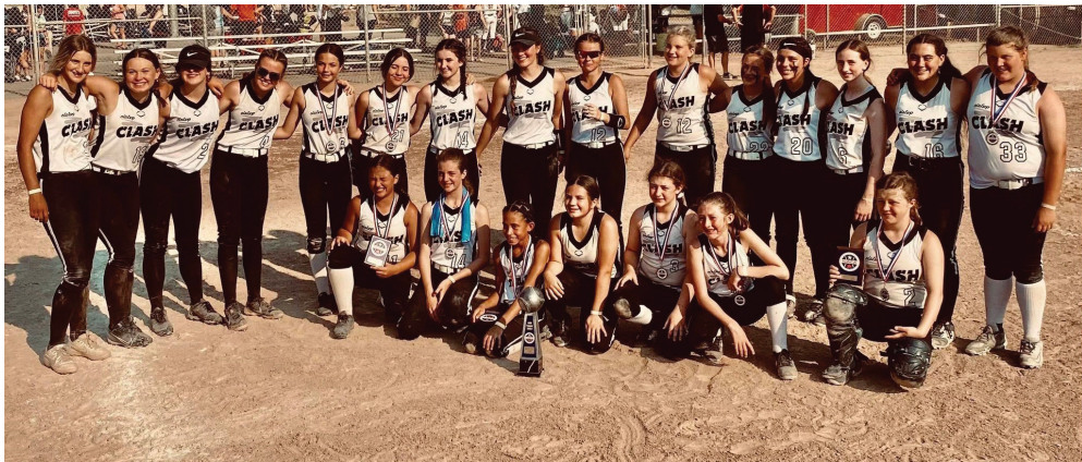
Clatsop Clash softball

The 12U and 14U Clatsop Clash softball teams team up for a photo after winning national titles last weekend.