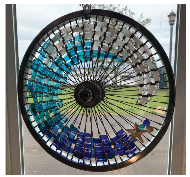
Glass artwork by Mlyss Maygra, shown at Skywater Home & Gallery.