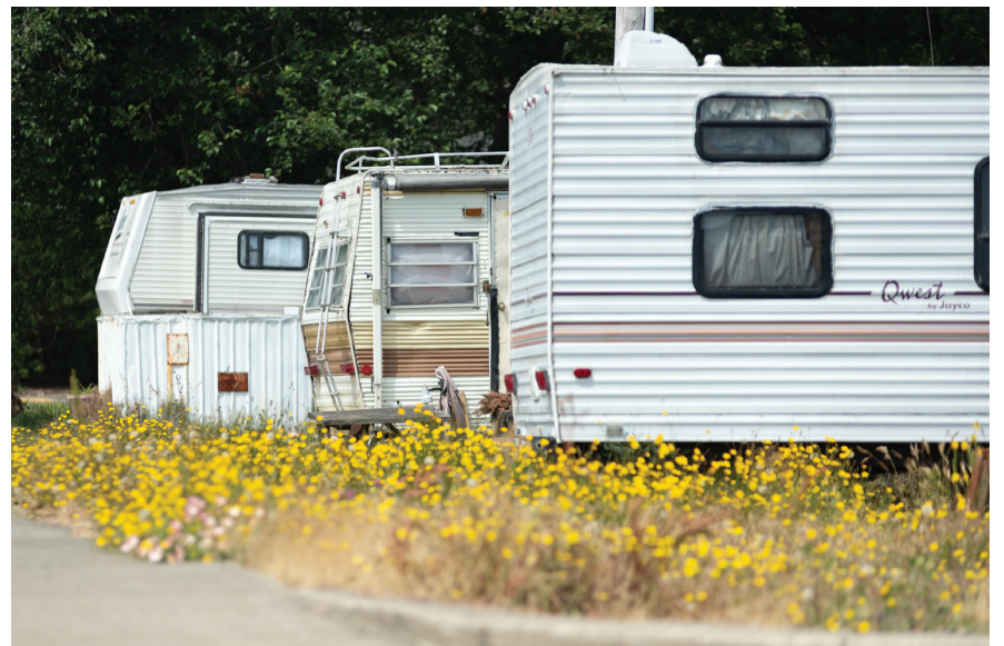
Beacon RV Park in Ilwaco.

Now the state is investigating the demolition of several trailers at the park in July as possible violations of