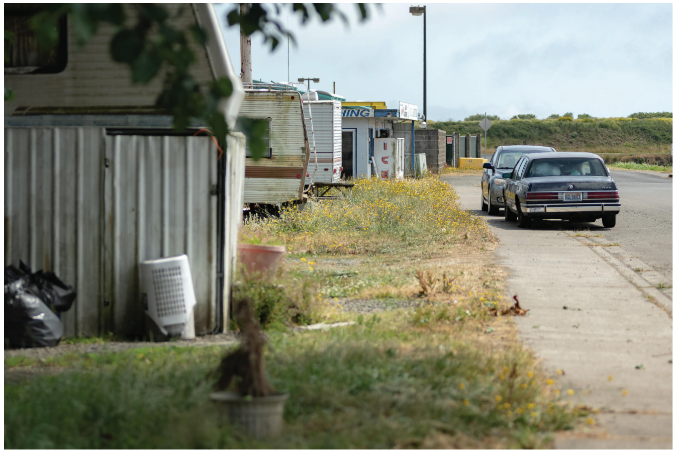
Garbage has piled up and the state noted a rodent infestation at Beacon RV Park.