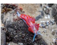
Seaside Aquarium Touch Tank