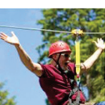
High Life Adventures Fly High Above the Oregon Coast