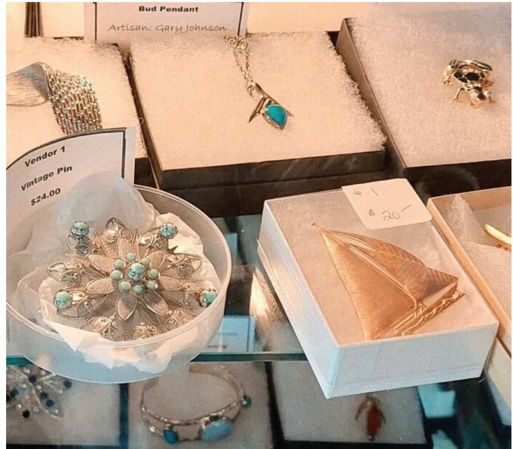
Jewelry pieces on display at SkyWater Home and Gallery.

ILWACO, Wash. – The Ilwaco First Friday Art Walk, with a theme of “Ready for Summer,” will be held from 3 to 6 p.m. on Friday.