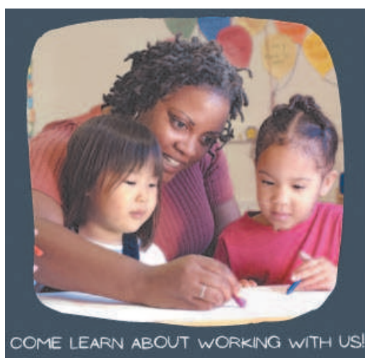
COME LEARN ABOUT WORKING WITH US!