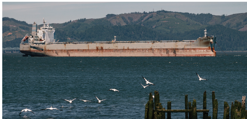
LEFT: A ship is surrounded by a flock of birds as it drifts along the Columbia.