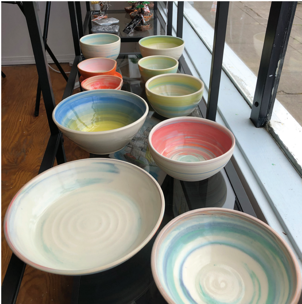
Ceramic bowls on display at West Coast Artisans Gallery.