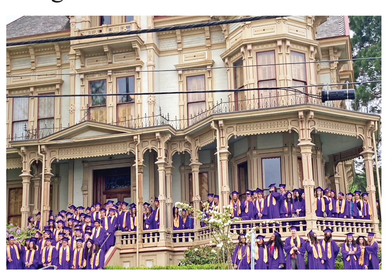
Astoria High School seniors gathered at the Flavel House Museum on Thursday as part of the annual Grad Walk.

'IT'S A TIME, NOT ONLY FOR GRADUATION, BUT AN END-OF-THE-YEAR CELEBRATION, AND IT MEANS MORE THIS YEAR BECAUSE WE WERE ABLE TO STAY IN SCHOOL ALL YEAR.'