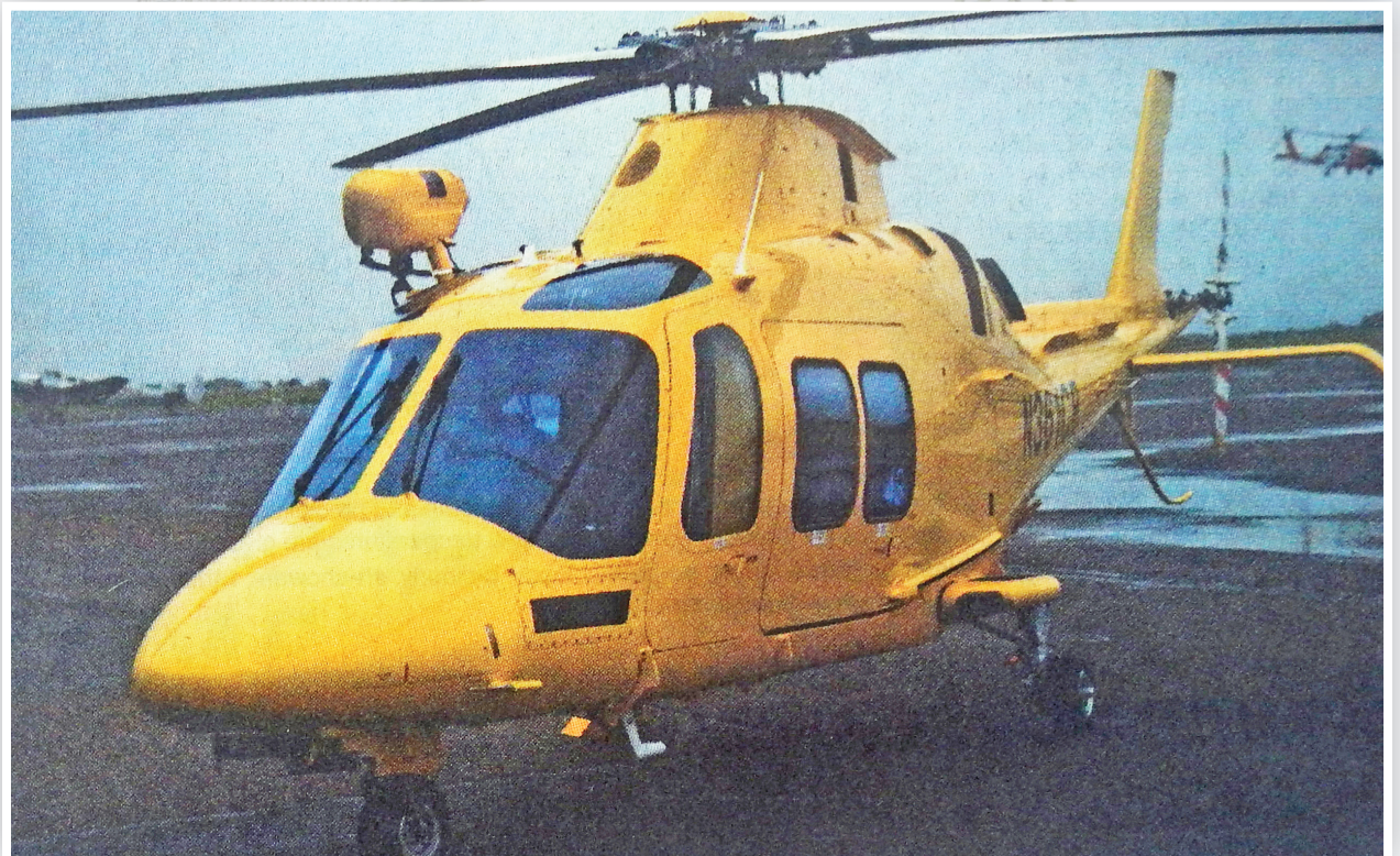
The Columbia River Bar Pilots' Italian-made AgustaWestland GrandNew helicopter is seen in 2012.

To maintain a prosperous horse breeding industry in Oregon, the state needs more racing days which means another major racetrack