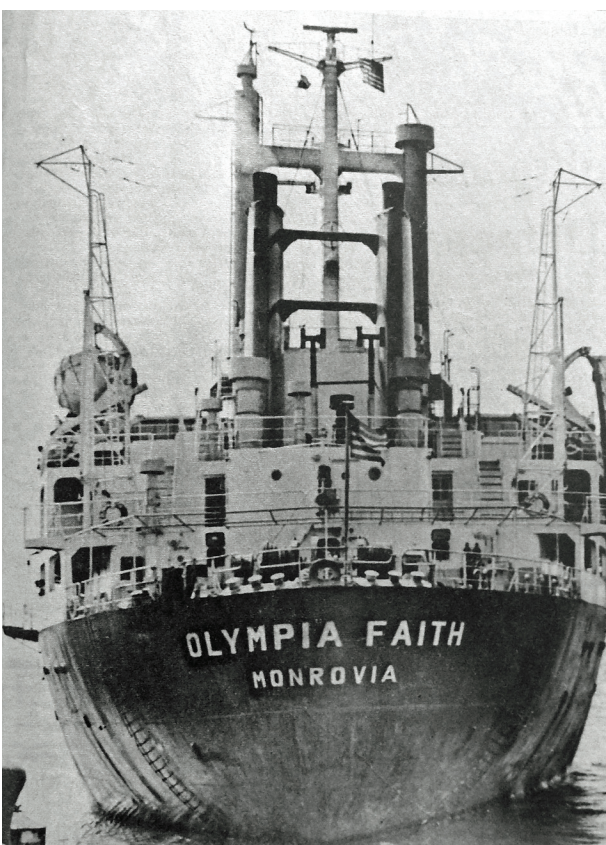
The main lifeboat of the log ship Olympia Faith hangs from one arm of its carrier in 1972. The lifeboat's occupants got a little wet when an arm of the hoist broke sending all into the water. No injuries were reported.