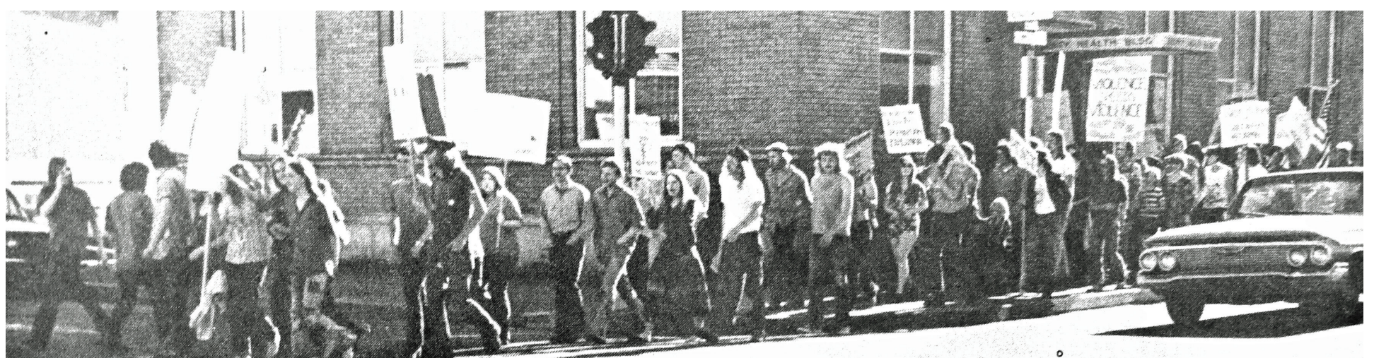
Protesters against the Vietnam War walk through downtown Astoria in 1972.

From here, following minor repairs, the Dansco will proceed to Alaska for shooting of the film titled "Harpoon."