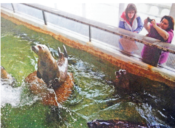
Visitors watch the antics of the seals inside the Seaside Aquarium in 2012.