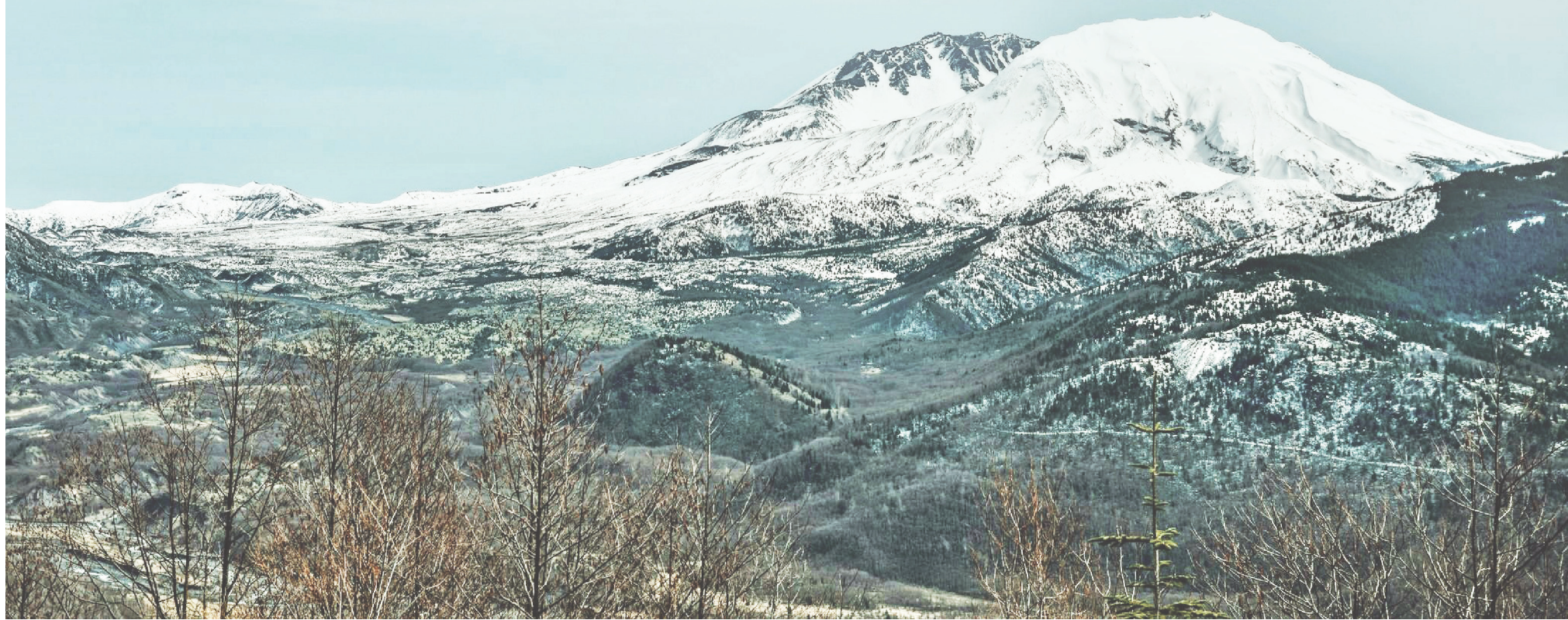
A snow capped Mount St. Helens.