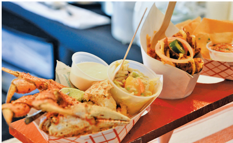
Attendees of this year's festival can expect to find delicious seafood from dozens of local vendors.