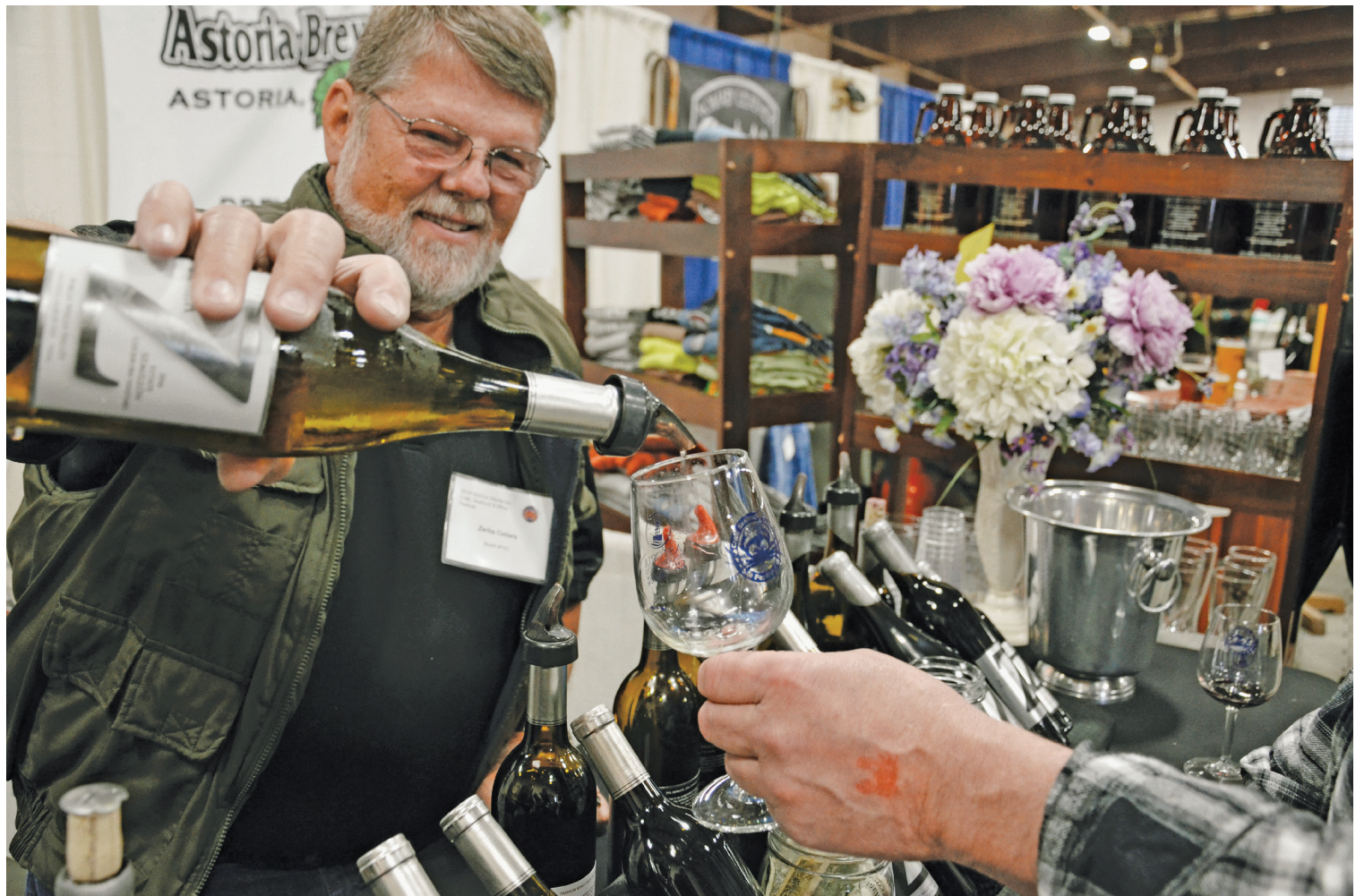
Dundee winery Zerba Cellars will return with a sampling of Oregon wines at this year's Crab, Seafood & Wine Festival.