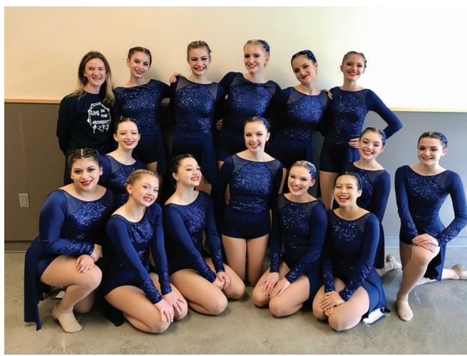
Astoria High School