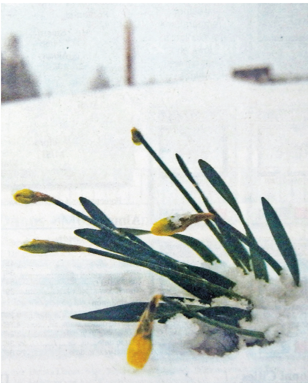
Daffodils poke out of the snow below the Astoria Column in 2012.

existing entrance, thereby closing the entrance to a surge produced by the east winds.