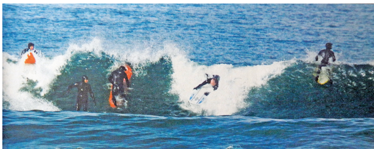
Surfers ride the waves near the Cove in Seaside in 2012.

A new breakwater would be built alongside the Union Fishermen's cannery, extending into the river almost to the pierhead line, then turning downriver and overlapping the