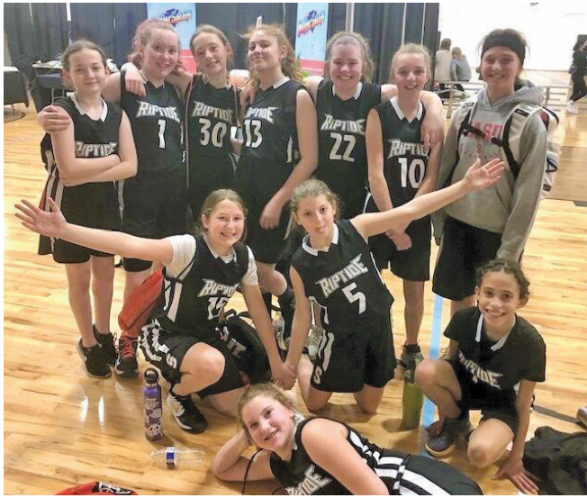
The Seaside Riptide sixth grade team.