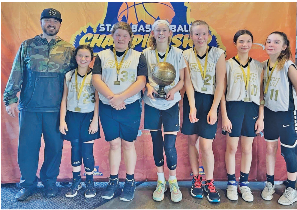
The Astoria Fish, sixth grade state champions.