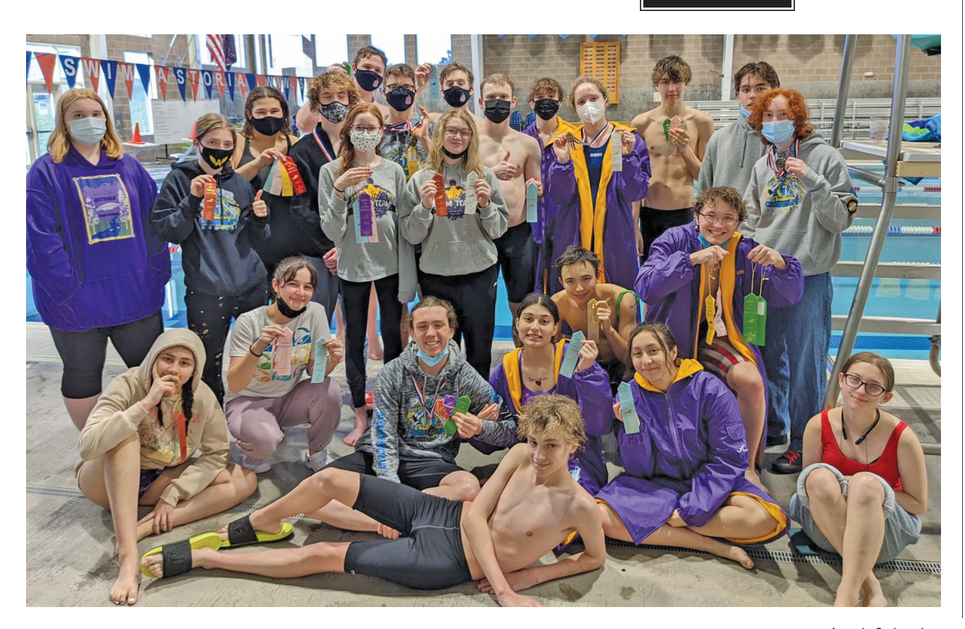
The Astoria swim team, including 15 state qualifiers, following last week's district meet.