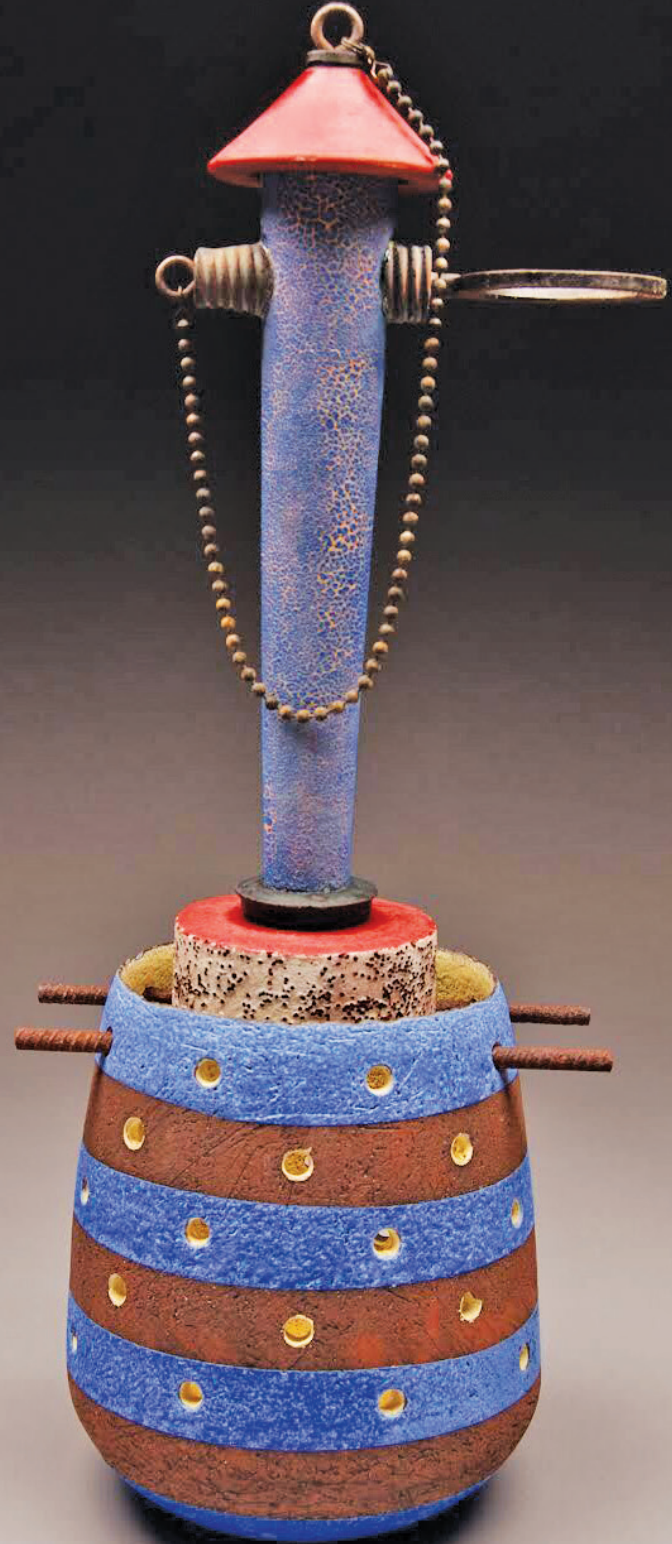
Jim Koudelka's 'Stripey,' is a ceramic and mixed media sculpture, 28 x 12 x 8.

The gallery presents Shifty Seas, an exhibition held in conjunction with the