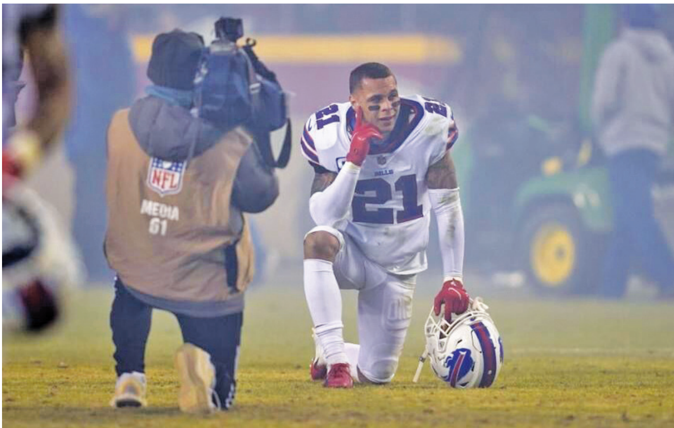
Buffalo Bills free safety Jordan Poyer kneels on the field after Sunday's loss in Kansas City. The Chiefs won the dramatic game in overtime, 42-36.