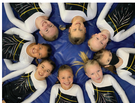
The Xcel Bronze team for Infinity Gymnastics.