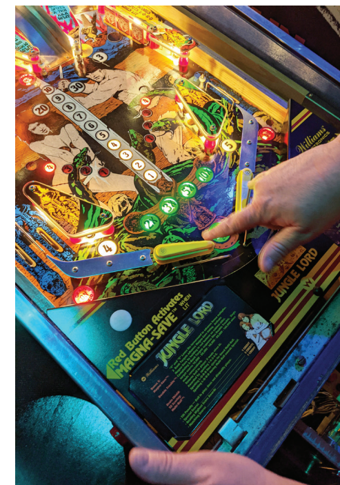
A pinball machine lights up.