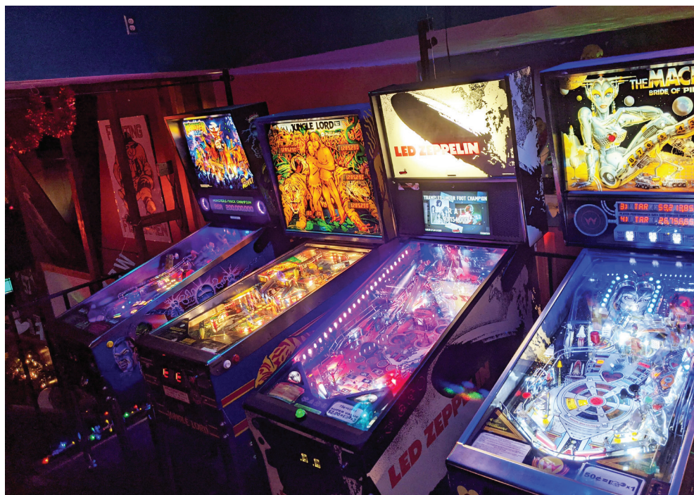
The pinball machines stand aglow at the Merry Time.