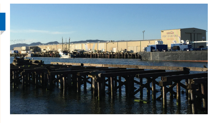
Da Yang Seafood has a processing plant at the Port of Astoria.