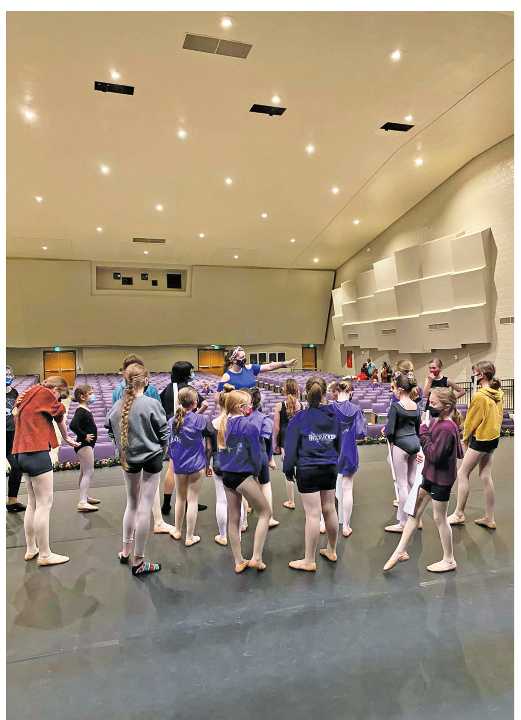
Rehearsals for 'The Nutcracker' began in early October.