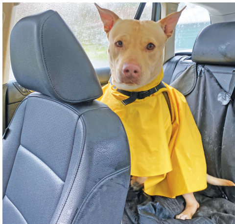
Shelter dog 'Shasta' is prepared for a rainy North Coast day.

Send text message donations by texting CAANOW to 44-321