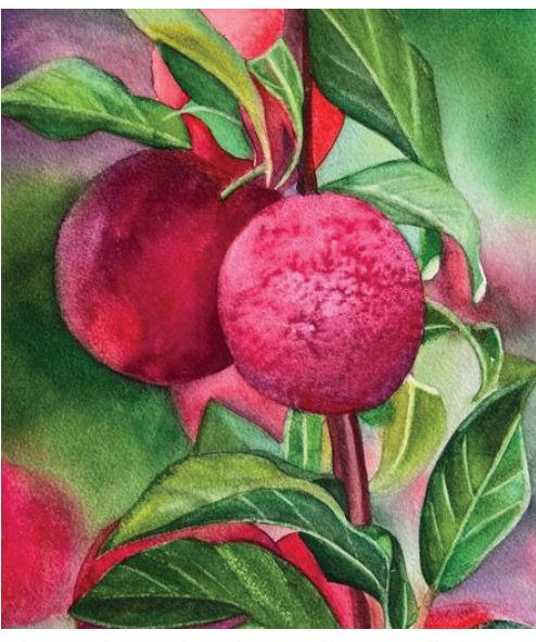
display at A Great Gallery.