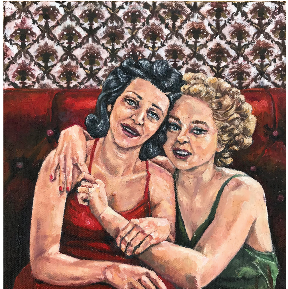
'The Red Booth,' by Amelia Santiago, will be on display at Imogen Gallery.