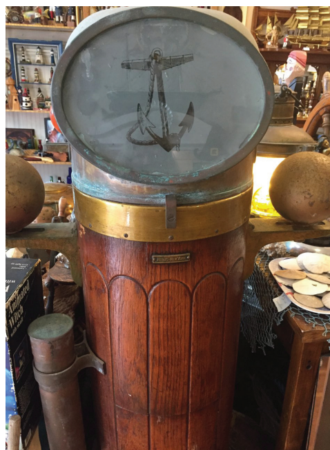
An Antique binnacle on display at Pacific Heirloom and Collectables.

lobby, dining room and halls, features original art and prints from a curated list of Portland artists.