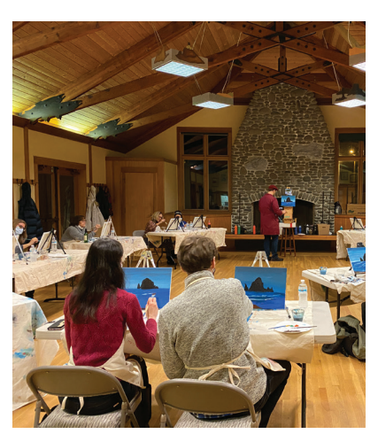
The Stormy Weather Arts Festival will hold multiple Paint and Sip events.

Music around town from 11 a.m. to 5 p.m. Saturday at the Coaster Theatre courtyard, Kiki's courtyard, Sandpiper Square and The Landing.