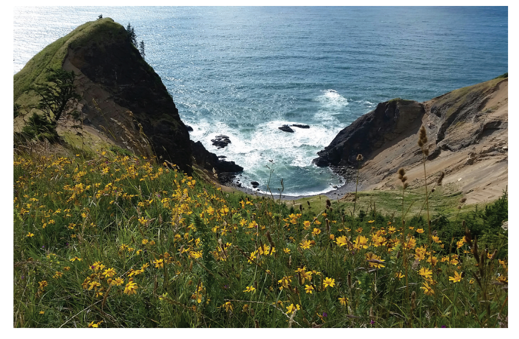
Thursday's Nature Matters series will focus on coastal prairies.