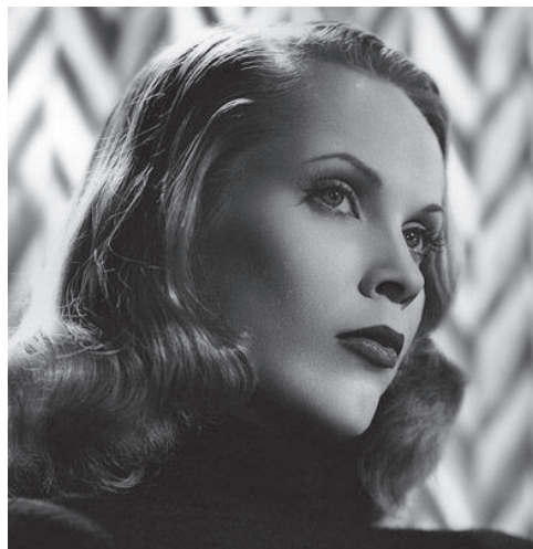
Actress Maila Nurmi lived in Astoria as a teenager.