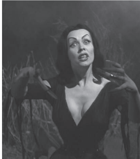
A scene from 'Plan 9 from Outer Space,' starring Maila Nurmi.

Maila Elizabeth Nurmi, the actress who became known as Vampira, was born in 1922 in Gloucester, Massachusetts. She moved to Astoria with her family as a teenager in 1939.