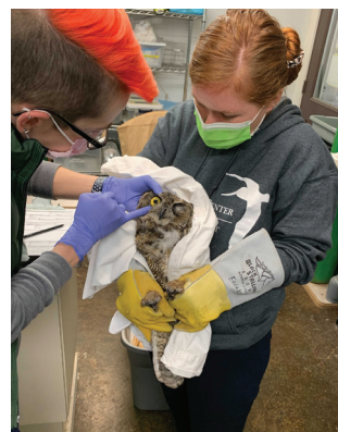
Wildlife Center of the North Coast A great horned owl receives treatment from members of the Wildlife Center of the North Coast.

Tickets to the event are $15 for single admission and $100 for a virtual table of eight people. All ticketed attendees receive five entries into the door prize drawing that will take place during the livestreamed event Sunday at 6 p.m. The silent auction is open now and will conclude during the live event.