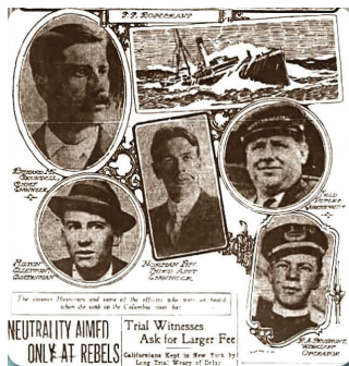
A 1913 news article about the victims of the Rosecrans shipwreck.