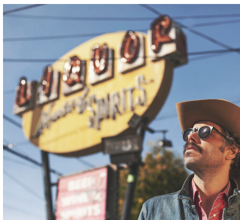
Lasers Lasers Birmingham

The concert is made possible by a community grant. For more information, visit tolovanaartscolony.org , email tolovanaartscolony@gmail.com or call 541-215-4445.