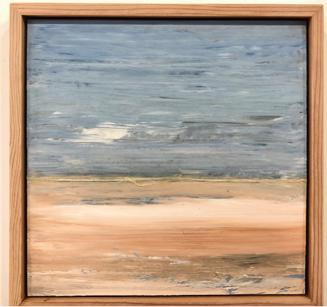
Annie Eskelin will show her intuitive 'Coastal Inspirations' at Forsythea.

A unique custom furniture company that specializes in epoxy river tables and reclaimed