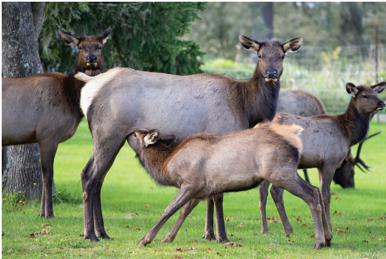
An elk calf drinks milk from its mother in Warrenton.