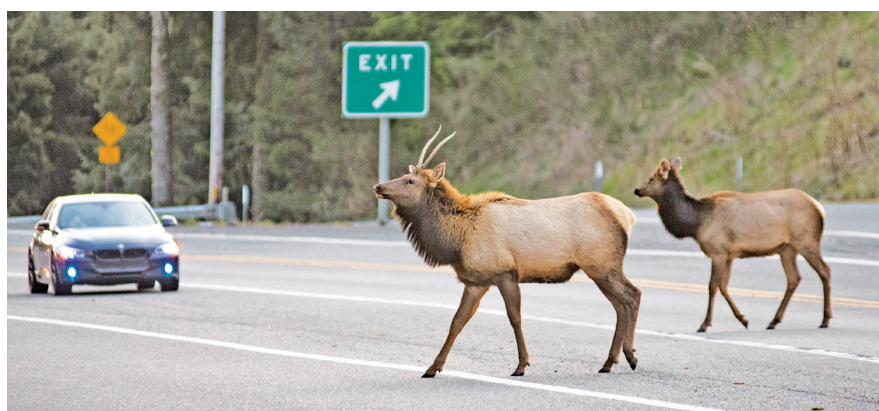
Elk stroll across U.S. Highway 101 near Cannon Beach.