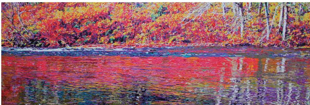
'Reddish Reflections' by Greg Navratil, of Seaside.