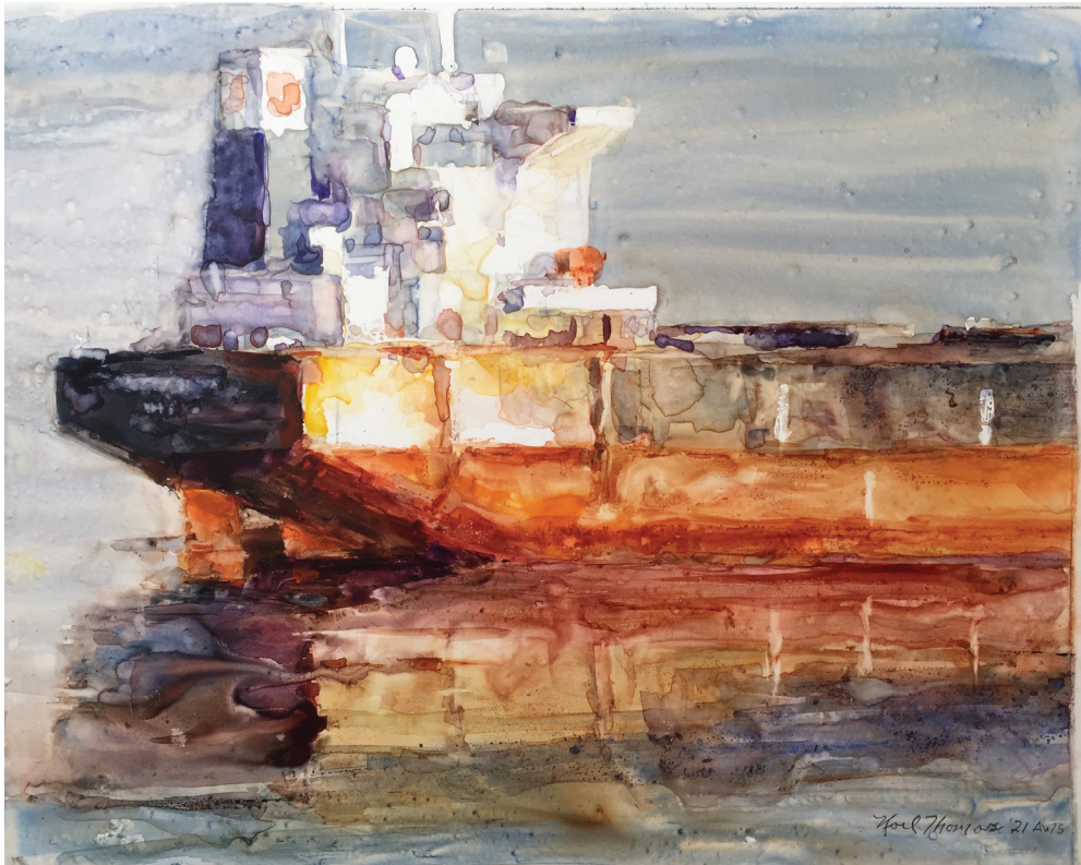
Noel Thomas' 'Ship Reflected' is shown at RiverSea Gallery.