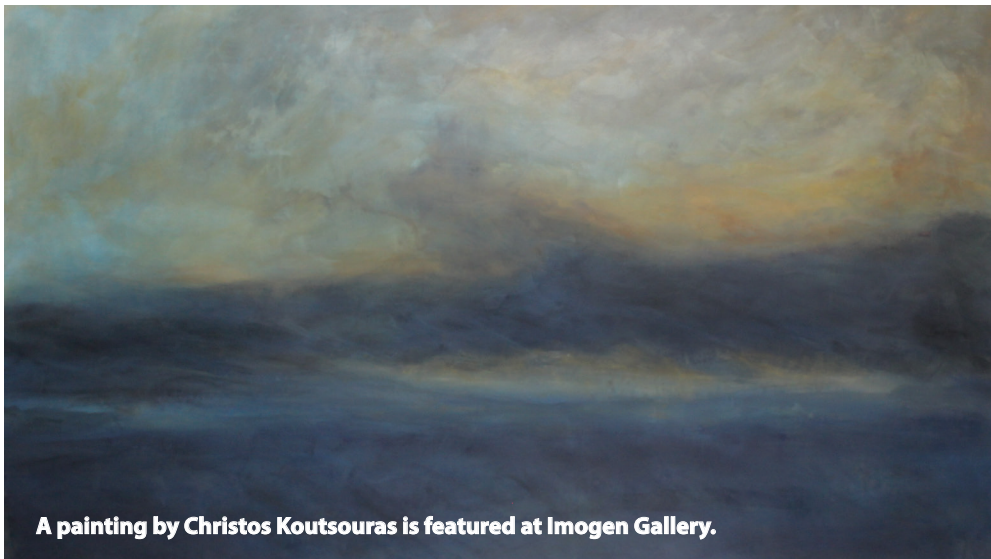
A painting by Christos Koutsouras is featured at Imogen Gallery.