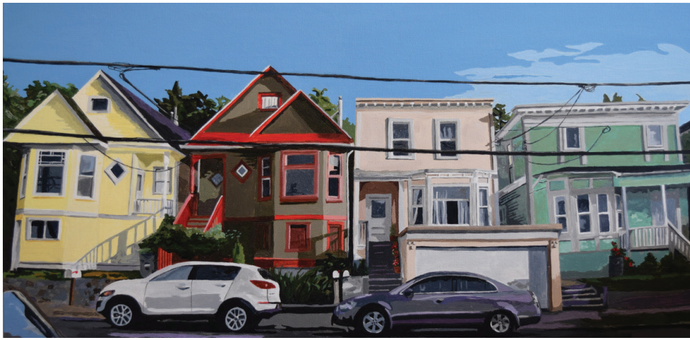
Connie Dillon's 'Four Houses, All Alike In Dignity' is shown at Connie Dillon Fine Art.