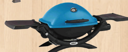
Weber Q 1200 LP Gas Grill