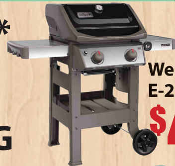
Weber Spirit II E-210 LP Gas Grill