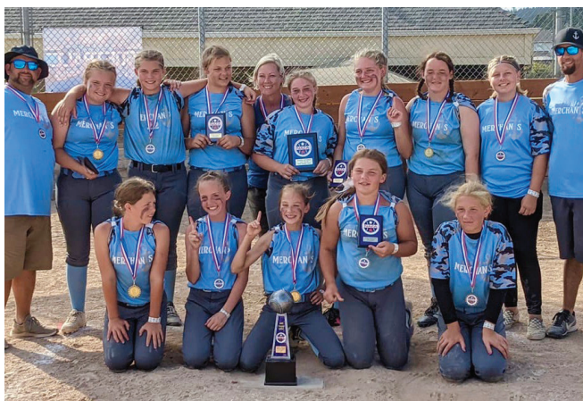
The 12U state champion North Coast Merchants.

The 12U Merchants and the Future Fish both went