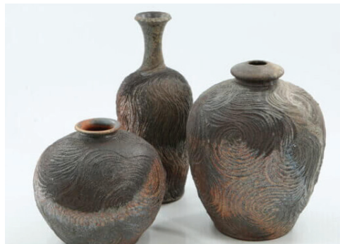
Some of Audrey Sloan's ceramic vases.

Sloan will feature anagama-fired ceramics. The works celebrate different natural elements. Pieces are inspired by observing Bay City and Tillamook Bay.