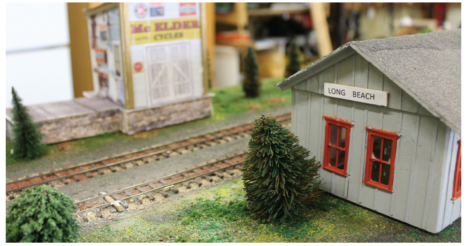
Meticulous detail is required to determine the scale and appearance of buildings, including train stations, depots and foliage surrounding the railroad lines.

Model railroad enthusiasts share similar enthusiasm for their hobby, but they split into different groups who favor a certain gauge rail. This determines the size of the trains, carriages and buildings.