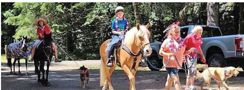
Some of the participants in the North Coast Oregon Equestrian Trails Fourth of July parade at the Northrup Creek Horse Camp.