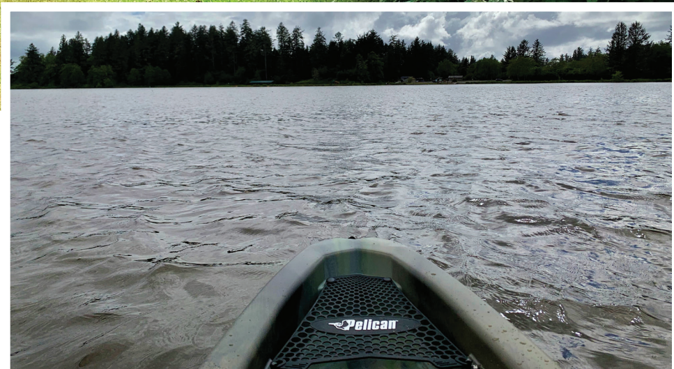
TOP: A group of people fish from a dock. ABOVE: Welcoming waters await kayakers on the lake.