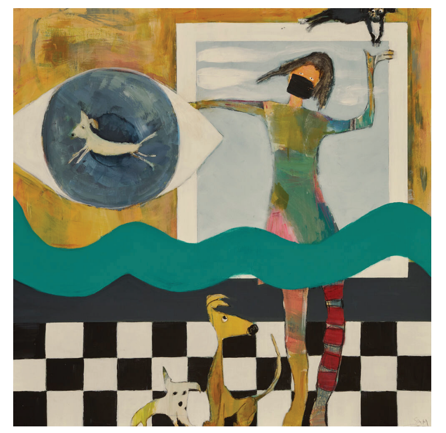
'Jake Jumps Into the Universal,' by Samyak Yamauchi, is shown at RiverSea Gallery.