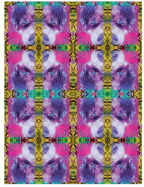
'Cartouche in Pink' by Cicely Gilman, is shown at Astoria Institute of Music and Center for the Arts.