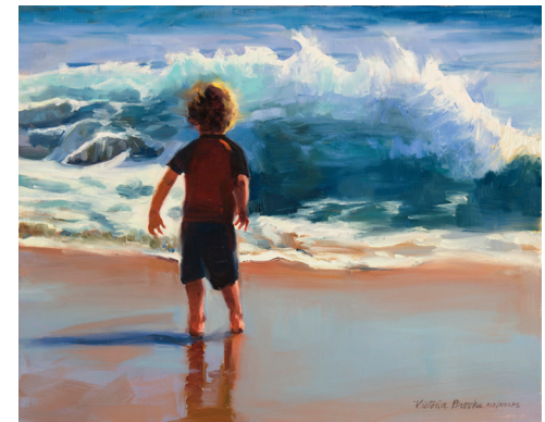
'Surfer Boy' by Victoria Brooks, is at Fairweather House and Gallery.

Find additional original art during the day at Seaside Coffee House , 3 N. Holladay Drive; Seaside Fiber and Yarn , 10 N. Holladay Drive; Bliss Mercantile & Brocante , 734 Broadway St.; Seaside Antique Mall , 726 Broadway St.; and at Rust and Dust Vintage , 810 Broadway St.