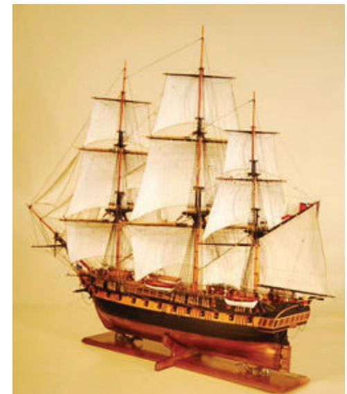
A vintage ship model, featured by Pacific Heirloom Art and Collectables.