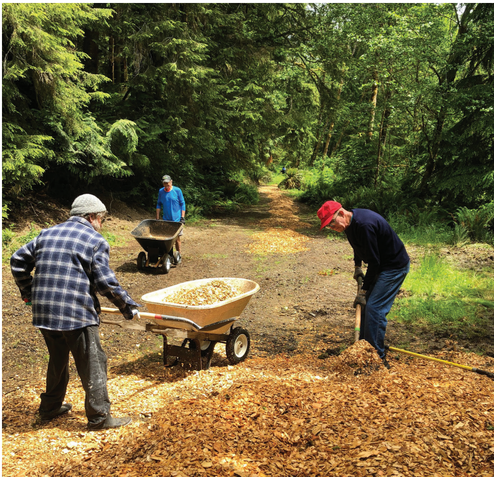
Volunteers gathered on June 5 to finish maintenance and repairs on Cutthroat Climb Trail and the Art Trail.