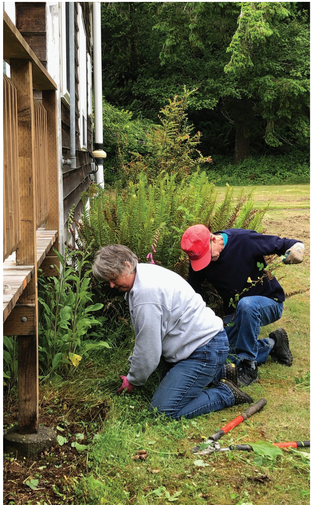
Two volunteers work on June 5.