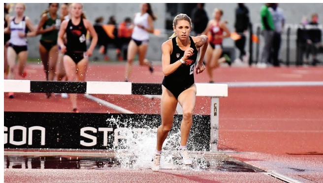
Oregon State University