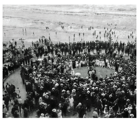
People gather at the Seaside Promenade's dedication ceremony in 1921.

SEASIDE — A photo exhibit in honor of the Seaside Promenade's 100th anniversary will be displayed at the Seaside Public Library from Thursday until Aug. 7.