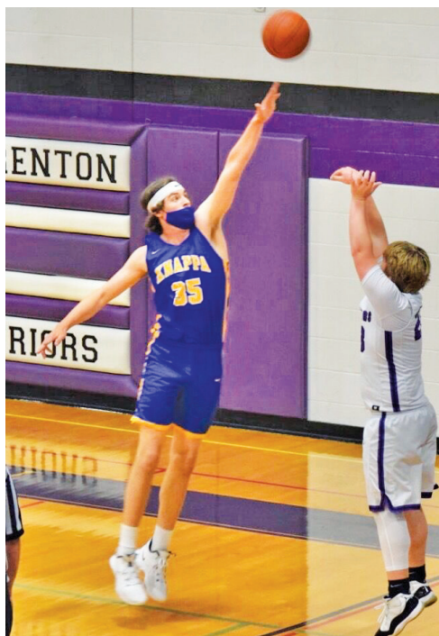
Warrenton Warrior Livestream