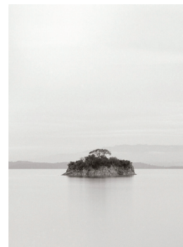
'Island' by Rory Earnshaw.

Also featured is a second exhibit, "A Banquet of Light," which features images by photographer Jim Fitzgerald of Vancouver, Washington. The selection is a collection of images from the Rockefeller Forest in Humboldt Redwoods of Northern California.