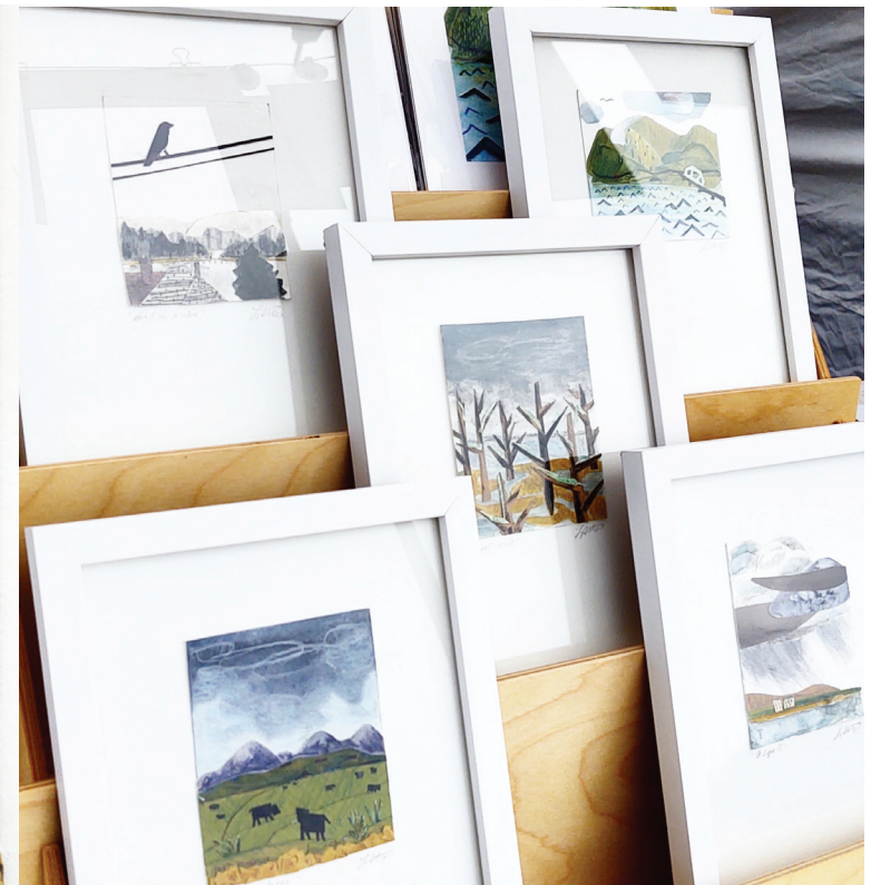
CLOCKWISE: A humpback whale Aarts made using watercolors. Aarts’ pieces on display at the Astoria Sunday Market. A collage of Cape Disappointment Aarts made during the 100 Days Project.